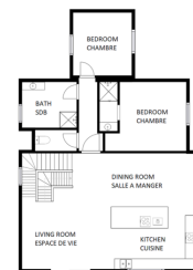
1st FLOOR 1er ETAGE