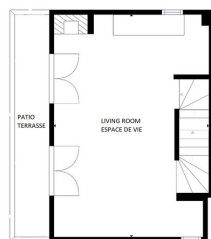
1st Floor 1er Etage