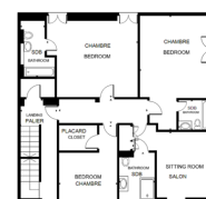
Premier étage / First floor