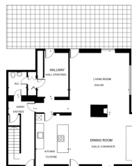
Rez-de-chaussée / Ground floor